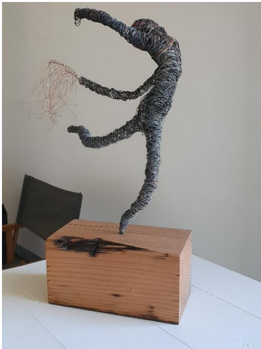
20. 'Free from the Mask, Free to be, Free to Dance' Copper wire, Fine copper mesh mask, Oregon base $ 600