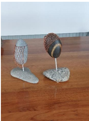
a) Small $ 300 each

Health and essential workers 'rock solid' during the first years of the pandemic