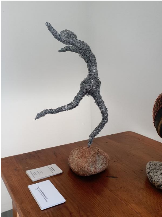
19. 'Want to Fly, Want to see me try' Foil, Galvanised wire, East Coast Granite $600