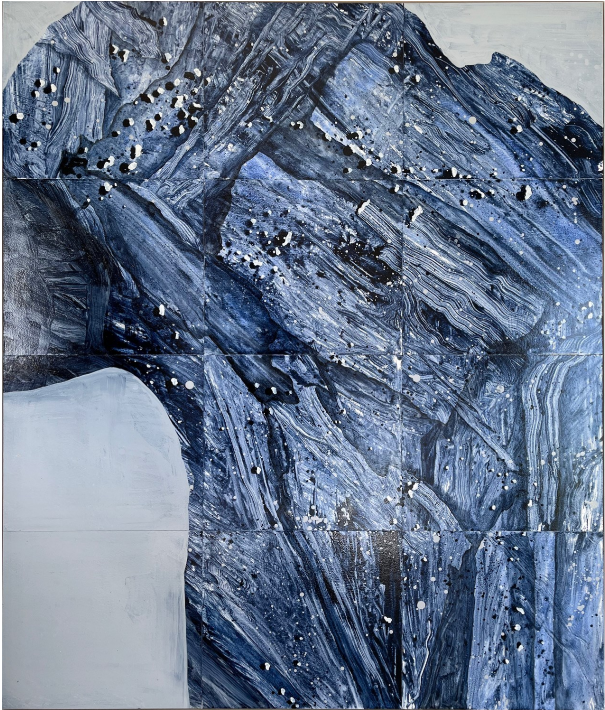
8. Southwest Abstractions Oil on Wood H 160 x W135 cm $3500

Blenheim Gallery and Garden 733 Cressy Road, Longford Tasmania M: 0419584667 www.blenheimgalleryandgarden.com.au