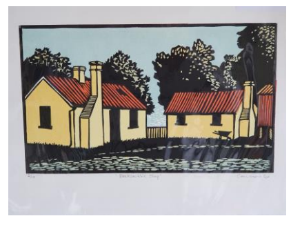
Blacksmith's Shop Edition 10 Colour linocut - multi-block & reduction 180 x 215 cm framed $360 un-framed $230