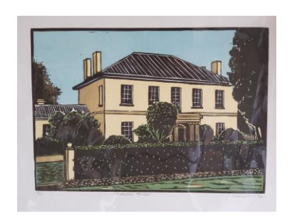
Franklin House Edition 10 Colour linocut - multi-block & reduction 215 framed $360 un-framed $230