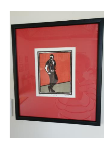
Bus stop Edition 10 Colour linocut - multi-block & reduction 120 x 130 cm framed $180 un-framed $100

Escapade Edition 56 • edition sold Colour linocut - multi-block & reduction 200 x 200 cm framed $360 un-framed $230