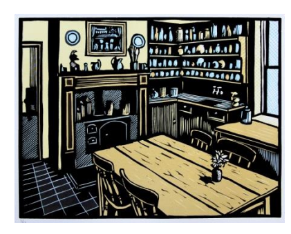
• edition sold