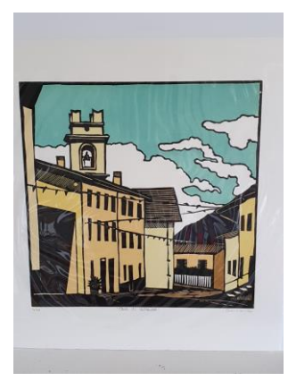
Obra di Vallarsa' Edition Multi-block Linocut 300 x 300