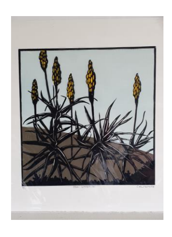
Aloe striatula Edition 10 Colour linocut - multi-block & reduction 300 x 300 framed $400 un-framed $250