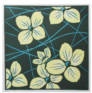
Cornus capitata Edition 10 Colour linocut - multi-block & reduction 300 x 300 framed $360 un-framed $200