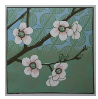
Chaenomeles japonica Edition 10 Colour linocut - multi-block & reduction