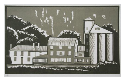
Ritchies Mill Edition 12 Colour linocut - single block & reduction 300 x 180 framed $360 un-framed $230