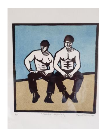
Sunday morning Edition 10 Colour linocut - multi-block & reduction 145 x 150 cm framed $180 un-framed $100