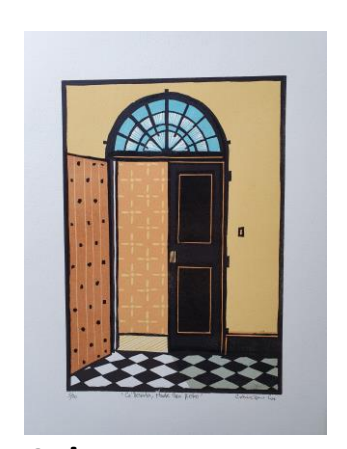
Ca'Deserta, Monte San Pietro Edition 20 Multi-block reduction Linocut 190 x 270 framed $360 un-framed $230