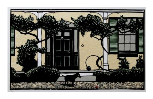
Tasmanian Colonial Edition 12 Colour linocut - multi-block & reduction 365 x 220 framed $400 un-framed $250