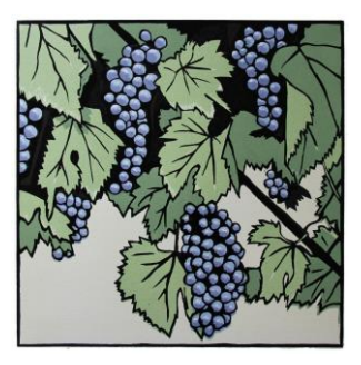
Montefalco vineyard Edition 20 Multi-block reduction Linocut 300 x 300 framed $400 un-framed $250