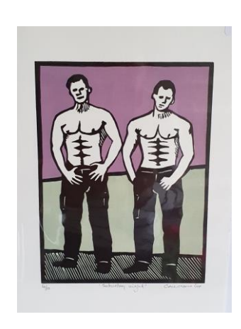
Saturday night Edition 10 Colour linocut - multi-block & reduction 150 x 200 cm framed $180 un-framed $100