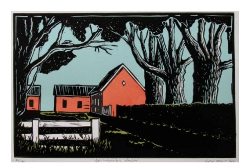
Springbanks Stable Edition 12 Colour linocut - multi-block & reduction 300 x 195 framed $360 un-framed $230