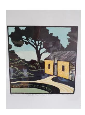
Jolly Farmer Kitchen Edition 10 Colour linocut - multi-block & reduction framed $360 un-framed $230