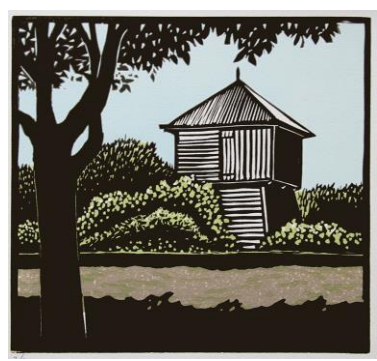
Water Tank, Cressy Edition 20 Colour linocut - multi-block & reduction 180 x 170 framed $360 un-framed $230