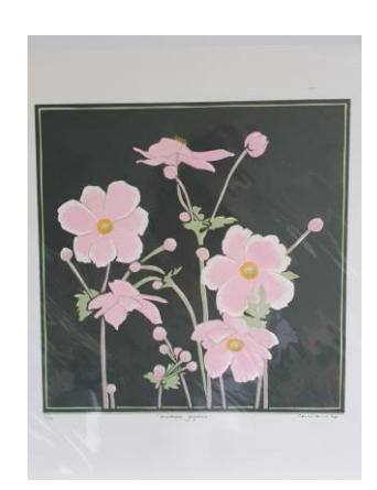
Anemone japonica Edition 10 Colour linocut - multi-block & reduction 300 x 300 framed $400 un-framed $250