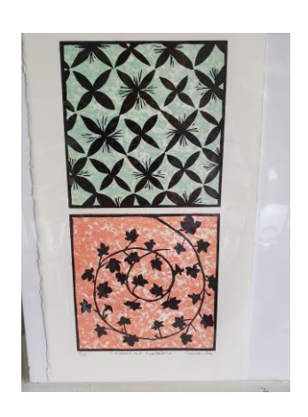
Clematis & Cymbalaria Edition 10 Colour linocut - multi-block 300 x 300 framed $400 un-framed $250