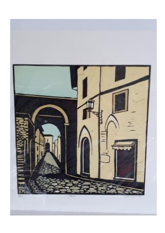
Assisi Edition 20 Multi-block reduction Linocut 300 x 300 framed $400 unframed $250