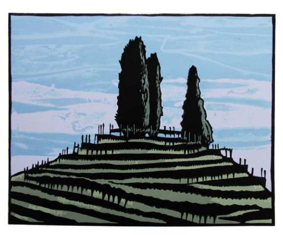
Collinetta sentiero dei pini

Morning in Spello Edition 20 Multi-block reduction Linocut 300 x 300 framed $400 un-framed $250