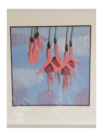
Fuchsia magellanica Edition 10 Multi-block reduction Linocut framed $400 un-framed $230