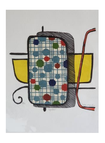
Spotted Edition 10 Colour linocut - multi-block & reduction 190 x 180 cm framed $180 un-framed $1000