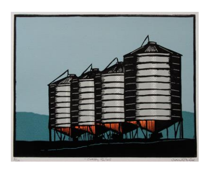
Cressy Silos Edition 10 Colour linocut - multi-block & reduction 270 x 215 framed $360 un-framed $230