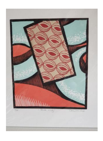
Blue ring Edition 10 Colour linocut - multi-block & reduction 150 x 180 cm framed $180 un-framed $100