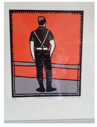
Train station Edition 10 Colour linocut - multi-block & reduction